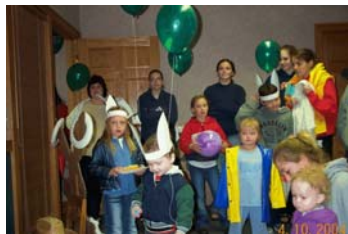
Even the men are having a good time!!!